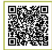
Emergency Room Alternatives

Make sure you use your Virtual Visits or PCP before spending more out-of-pocket costs on ER and Urgent Care Visits.