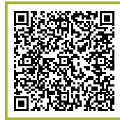
Scan/Click the QR code for Deductible Overview